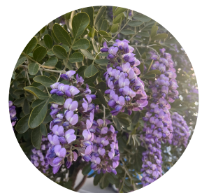
Cover photo: The purple blossoms of a Texas Mountain Laurel