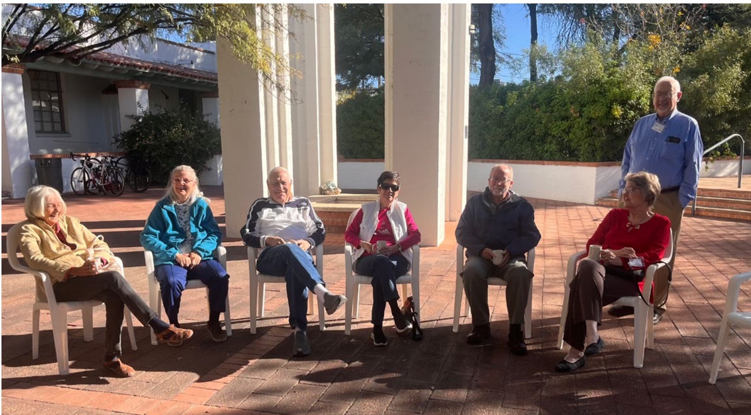
→ The pre-worship coffee chat crew

Yet, despite what some may consider a long transitional process, the ministries at St. Mark's have not slowed down. St. Mark's has made the most of this time: carrying